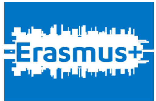
Erasmus + logo

In each country, there are consultants, different advisors and local websites, which offer opportunities for jobs, volunteering and exchanges. It doesn't matter if you are a student or an experienced professional looking for another challenge, the EU offers exciting opportunities according to your skills and interests. It will broaden your outlook and knowledge about different countries and cultures and for sure it will make you a lot more self confident and constantly learning.